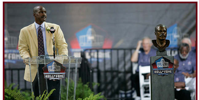
Art Monk (Class of 2008)