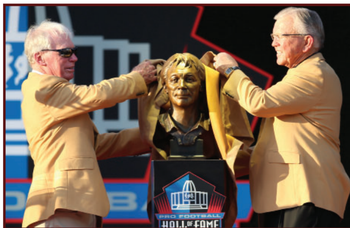
Bobby Beathard (L) and Joe Gibbs (R) unveil Beathard's Pro Football Hall of Fame bust during the enshrinement ceremony in Canton, Ohio.

Beathard was born in Zanesville, Ohio, on Jan. 24, 1937. He grew up in the Los Angeles area and attended El Segundo H.S. before playing quarterback at Cal Poly-San Luis Obispo, where he helped lead the 1957 and 1958 teams to consecutive 9-1 records.