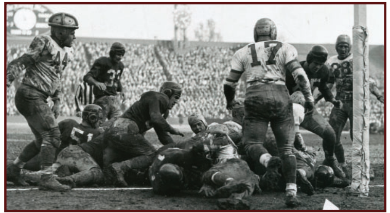
WASHINGTON REDSKINS 40 BOSTON YANKS 13 DEC. 14, 1947 - GRIFFITH STADIUM

After trailing 9-0 at halftime, the Washington Redskins were able to shut down the Bears offense in the second half and win 10-9. Despite five interceptions, Redskins quarterback Mark Rypien threw a critical touchdown pass to Gary Clark. Clark finished with six receptions for 85 yards in the victory. Kicker Chip Lohmiller sealed the win with 2:14 left in the game on a 35-yard field goal.