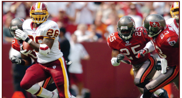
WASHINGTON REDSKINS 16 TAMPA BAY BUCCANEERS 10 SEPT. 12, 2004 - FEDEXFIELD