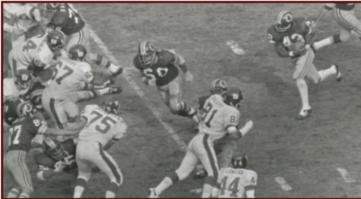
WASHINGTON REDSKINS 20 NEW YORK GIANTS 14 OCT. 19, 1969 - RFK STADIUM