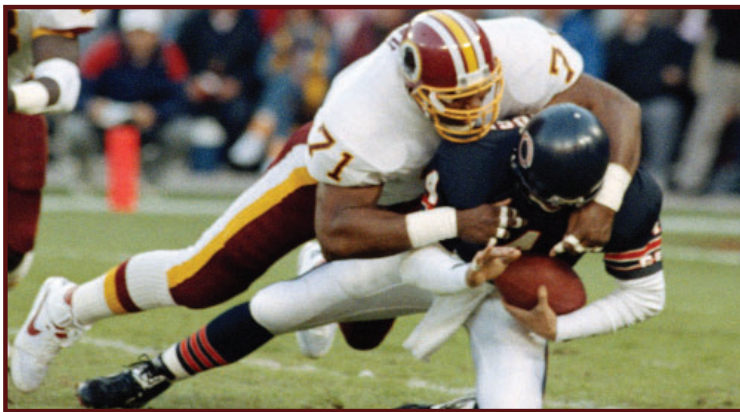
WASHINGTON REDSKINS 10 CHICAGO BEARS 9 DEC. 9, 1990 - RFK STADIUM

Larry Brown rushed for 105 yards and Charlie Harraway notched two rushing touchdowns, as the Redskins edged the Giants 20-14. Sonny Jurgensen connected 11-of-22 pass attempts for 111 yards to complement a rushing attack that recorded 172 combined yards. The Redskins scored 20 unanswered points and Rickie Harris sealed the comeback with an 86-yard punt return for a touchdown late in the fourth quarter.