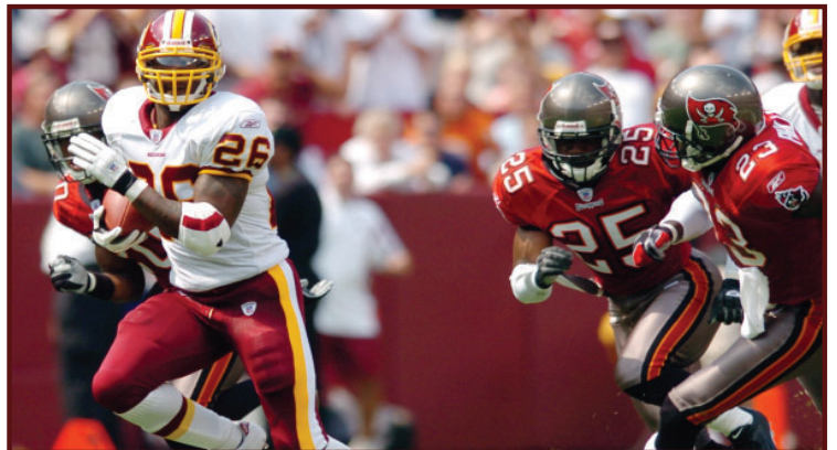
WASHINGTON REDSKINS 16 TAMPA BAY BUCCANEERS 10 SEPT. 12, 2004 - FEDEXFIELD