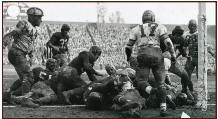
WASHINGTON REDSKINS 40 BOSTON YANKS 13 DEC. 14, 1947 - GRIFFITH STADIUM

After trailing 9-0 at halftime, the Washington Redskins were able to shut down the Bears offense in the second half and win 10-9. Despite five interceptions, Redskins quarterback Mark Rypien threw a critical touchdown pass to Gary Clark. Clark finished with six receptions for 85 yards in the victory. Kicker Chip Lohmiller sealed the win with 2:14 left in the game on a 35-yard field goal.