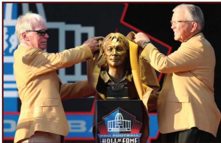
Bobby Beathard (L) and Joe Gibbs (R) unveil Beathard's Pro Football Hall of Fame bust during the enshrinement ceremony in Canton, Ohio.

Beathard was born in Zanesville, Ohio, on Jan. 24, 1937. He grew up in the Los Angeles area and attended El Segundo H.S. before playing quarterback at Cal Poly-San Luis Obispo, where he helped lead the 1957 and 1958 teams to consecutive 9-1 records.