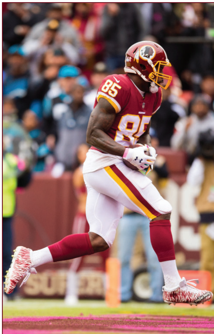
9t. Wesley Walls 1989-2003 [14] 54

"We all should get on Vernon Davis' diet. I mean, really. The guy's a freak. He's the most impressive guy I've been around really as far as taking care of his body, and whatever he's doing, he needs to tell all our young guys to do it because he's amazing.