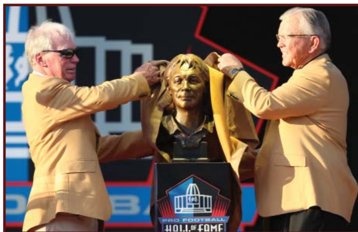
Bobby Beathard (L) and Joe Gibbs (R) unveil Beathard's Pro Football Hall of Fame bust during the enshrinement ceremony in Canton, Ohio.

Beathard was born in Zanesville, Ohio, on Jan. 24, 1937. He grew up in the Los Angeles area and attended El Segundo H.S. before playing quarterback at Cal Poly-San Luis Obispo, where he helped lead the 1957 and 1958 teams to consecutive 9-1 records.