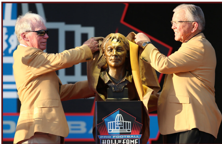
Bobby Beathard (L) and Joe Gibbs (R) unveil Beathard's Pro Football Hall of Fame bust during the enshrinement ceremony in Canton, Ohio.

Beathard was born in Zanesville, Ohio, on Jan. 24, 1937. He grew up in the Los Angeles area and attended El Segundo H.S. before playing quarterback at Cal Poly-San Luis Obispo, where he helped lead the 1957 and 1958 teams to consecutive 9-1 records.