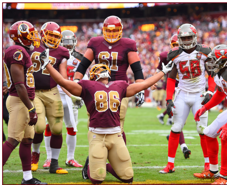
Tight end Jordan Reed (center) caught two touchdown passes, including the go-ahead score with 24 seconds remaining, as the Redskins completed the largest comeback in team history (24 points) against Tampa Bay last season.

Game notes: Until Sunday, the Redskins had won three games after trailing by 21 points, most recently in 1999. ... The Bucs were called for 16 penalties for 142 yards. ... Bucs WR Mike Evans caught his first TD pass of the season, a 40-yarder on the team's third play from scrimmage.