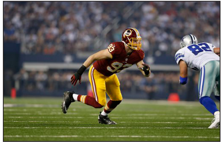
LB Trent Murphy

consecutive seasons for the first time since drafting S Sean Taylor, CB Carlos Rogers, LB Rocky McIntosh and S LaRon Landry with their first selections in the 2004-07 NFL Drafts.