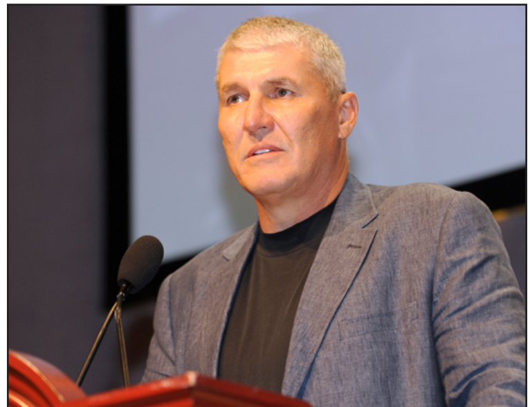
Quarterback Mark Rypien spent eight seasons in Washington from 1986-93, most notably leading the Redskins to victory in Super Bowl XXVI, securing Super Bowl MVP honors for a performance in which he completed 18-of-33 passes for 292 yards with two touchdowns. Rypien — seen in the lower speaking following the announcement of his selection to the Ring of Fame on Aug. 22 — helped give Washington its fifth world championship and third Super Bowl title in franchise history.